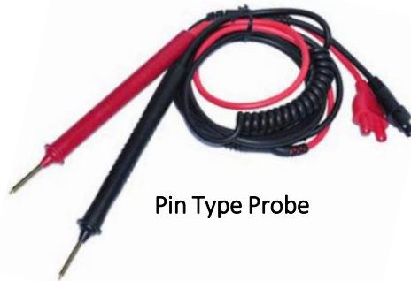
Pin Type Probe